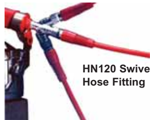
HN120 Swivel Hose Fitting