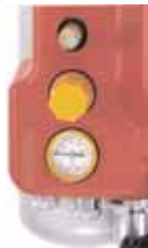
Yellow Outlets Regular Pressure

400 PSI Compressor High pressure compressor designed to operate High Pressure tools and regular pressure tools at the same time. WEIGHS 50 LBS! (AKH1050)