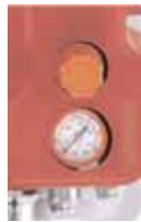
Orange Outlets High Pressure