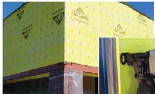
DensGlass® / Gypsum Sheathing to Steel