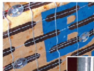
Metal Lath/Foam Board to Steel