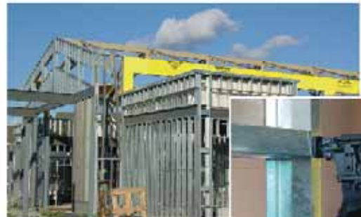
Light Gauge Steel to Steel Framing

VERSAPIN™ FASTENING SYSTEM One Tool for a World of Steel