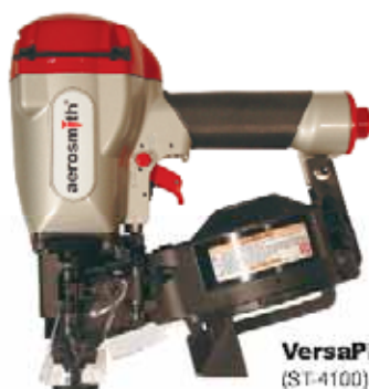
VersaPIN™ Tool (ST-4100)