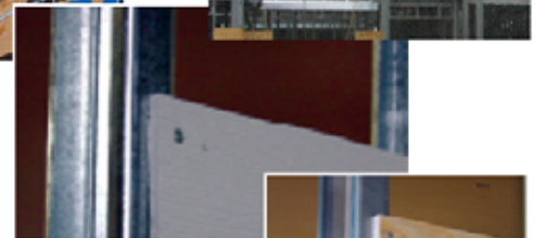
Fiber Cement Siding, OSB, and Plywood to Steel