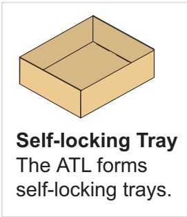
Self-locking Tray The ATL forms self-locking trays.

Fully Automatic Self-Locking Tray Forming Up to 35 trays per minute