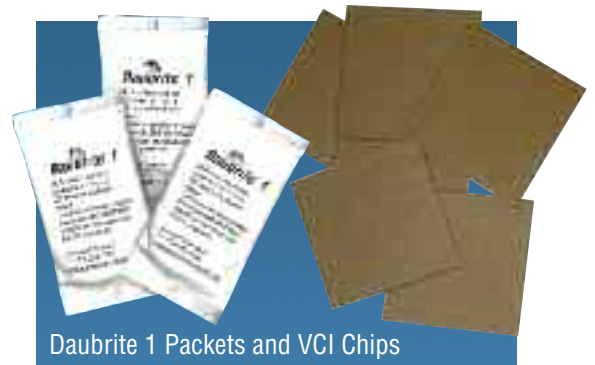
Daubrite 1 Packets and VCI Chips