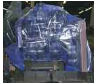
Engine Lay-Up Protection