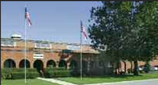
New corporate headquarters and manufacturing facility located in suburban Chicago

and wherever customers need Daubert Cromwell corrosion preventive packaging for their valuable metals.