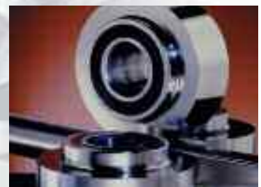
Closed Systems Lubrication