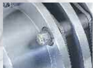
Metal Parts Protection

This selection guide to Daubert Cromwell liquids and powders is intended for general reference only. For complete product information, specific recommendations and selection assistance, call +1-708-293-7750, 800-535-3535, or e-mail info@daubertcromwell.com