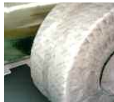
VCI Coil Protection