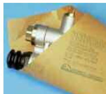
VCI Papers, Bags and Wraps for Small Part Packaging