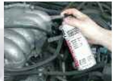
Spray-On Multi-Metal Inhibitor