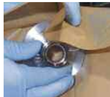
VCI Packaging for Gears, Bearings

Daubert Cromwell is a U.S. Government approved supplier of products qualified for critical U.S. Military applications.