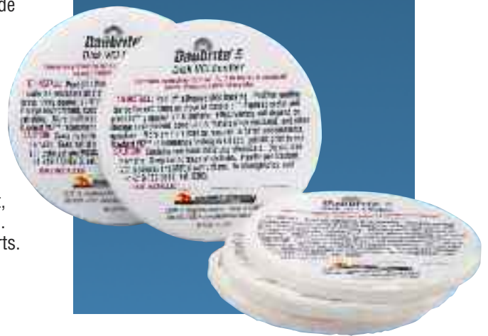
Daubrite Disk Emitters