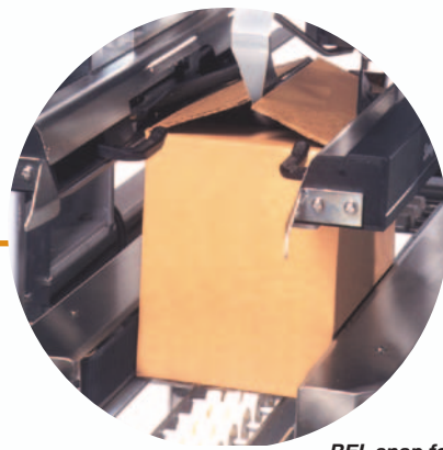
BEL snap folders provide long lasting reliable service.