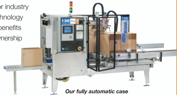
Our fully automatic case formers offer superior performance and maximum uptime.

through greater dependability, higher productivity, maximum throughput and a high standard of safety. Consider our ground breaking top-flap folding Snap Folder, the revolutionary Pin and Dome mechanical case opening technology, the Uni-drive case transport system, and others. Wexxar creates solutions for any case packing need.