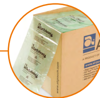
High-yield, boxed material requires less lifting and fewer changeovers