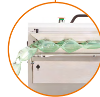
Knifeless design eliminates primary wear item found on other void-fill air pillow machines