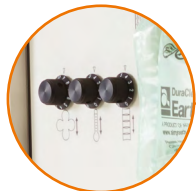
Operator friendly controls for easy set-up and operation