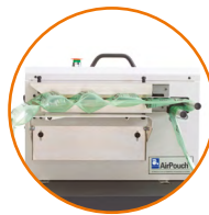
Compact design for easy pack station integration