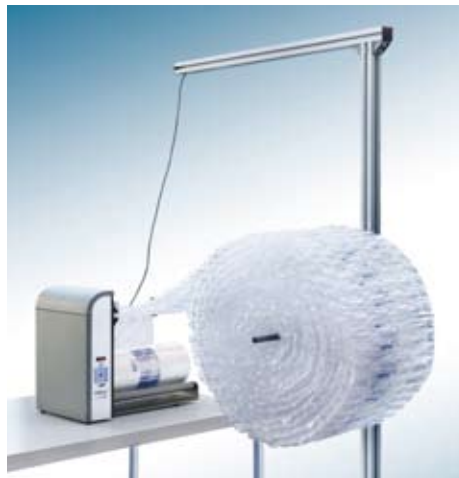
AIRplus® GTI shown with optional AIRplus® Coiler

For Sales & Service Contact R.V. Evans Company 800.252.5894 www.rvevans.com