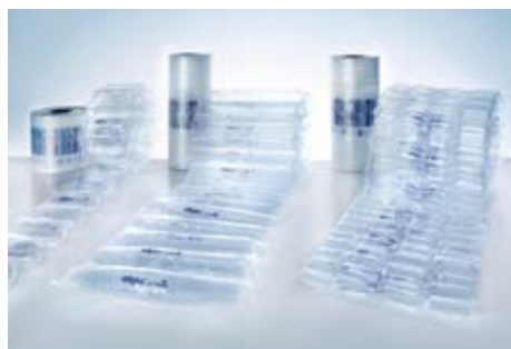
Storopack offers a wide variety of film sizes and styles including AIRplus® Void Film, AIRplus® Tube and AIRplus® Cushion Film.