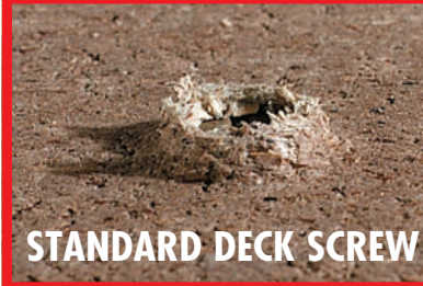
STANDARD DECK SCREW