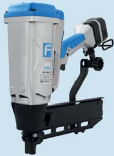
F70G FENCE 40-315